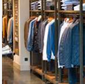
STORE SHELVING SYSTEMS