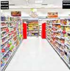
MARKET SHELVING SYSTEMS