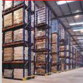
WAREHOUSE SHELVING SYSTEMS