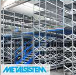
GALVANIZED LIGHT and HEAVY DUTY WAREHOUSE SHELVES